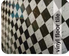
vinyl floor tile