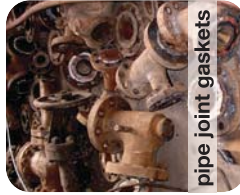
pipe joint gaskets