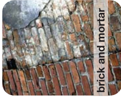
brick and mortar